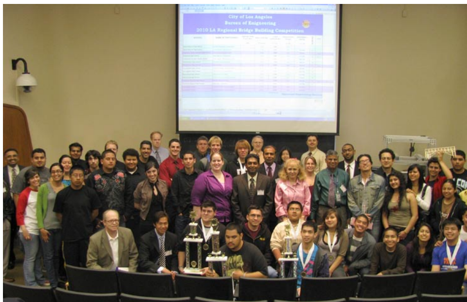
BOE Mentors, teachers and high school students that participated in the Bridge Building Contest.